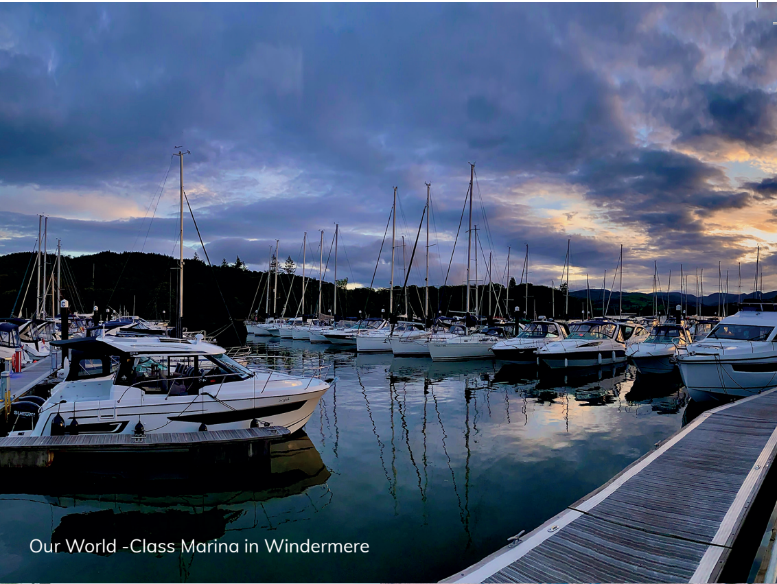
Our World -Class Marina in Windermere